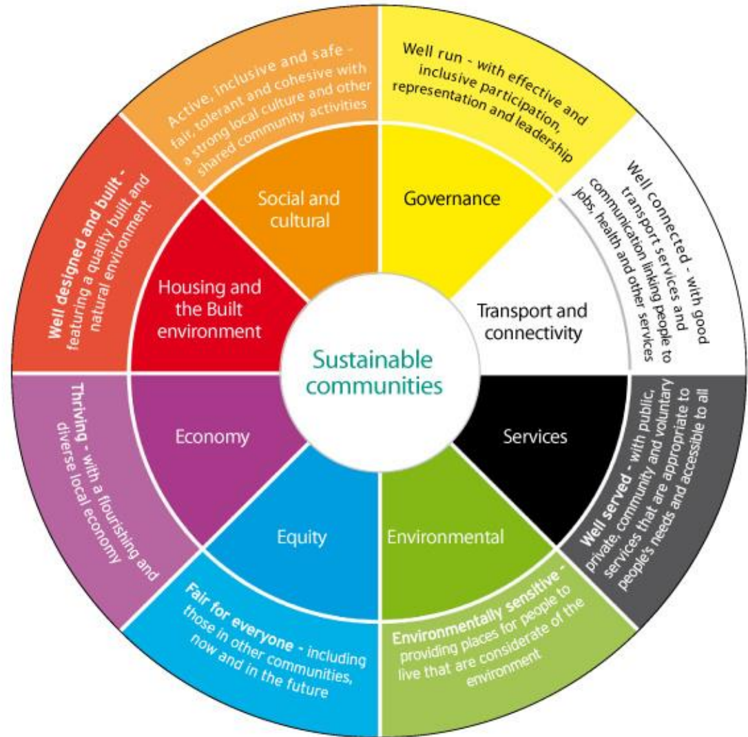
The Egan Wheel

As a basis for discussion, this workbook suggests a 20 year vision for each aspect of a sustainable community, invites you to consider where you are now in the context of that vision and to then think about the actions that may need to be taken over the next 20 years to underpin your community’s future.