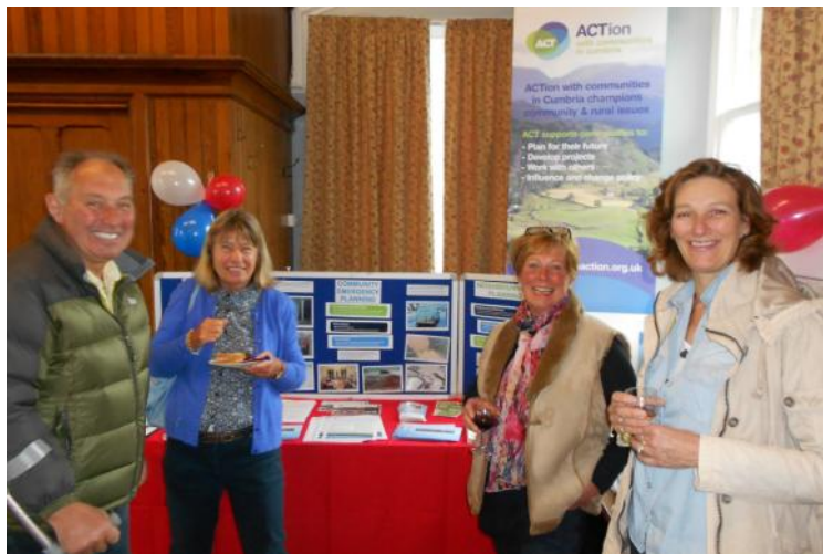
Barton residents enjoy the recent 'Liberteas' event as part of the 800th anniversary of Magna Carta.

If you've had difficulty in phoning us, we're really sorry, please do try again. If you can email us, we'll get back to you as soon as possible.