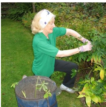
Lend a Hand Volunteer providing gardening help

NFG website: www.northernfellsgroup.org.uk