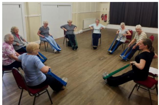
Current exercise class at Seaton Village Hall

"I'm sorted now till next week, I feel so much better after the session and I can do a couple of daily stretches to keep me going".