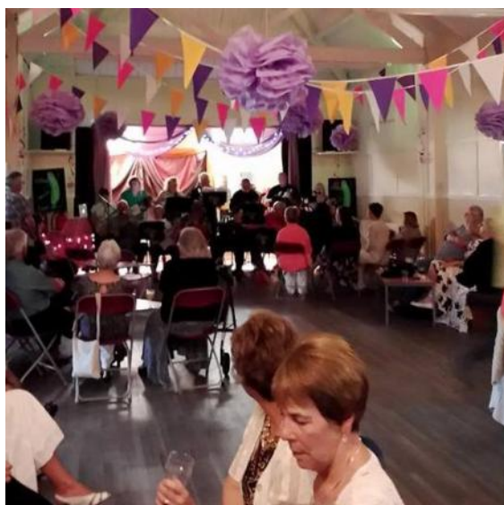
Social event at Seaton Village Hall