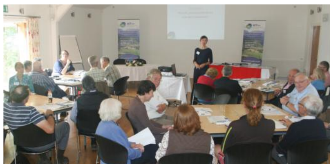
Participants at last year's event at Brigsteer Village Hall discuss 'How to involve people'

If you have a project you would like to showcase do let us know, we currently have three lined up and a couple of spaces left.