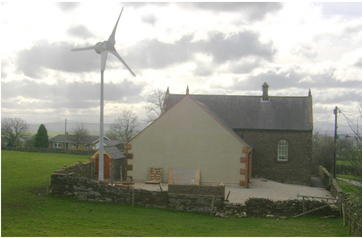
Gamblesby Village Hall and wind turbine