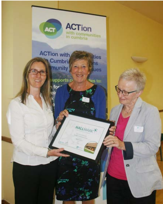
Beck Community Centre receives Hallmark 1 award

ACT continues to coordinate this nationally recognised quality assurance scheme for community buildings, with the support of trained peer assessors. It provides a benchmark for well managed community facilities, giving volunteers, hirers, funders and others confidence that the hall is run well. Congratulations go to Beck community centre and Longtown Memorial Hall on achieving Hallmark 1 this year.