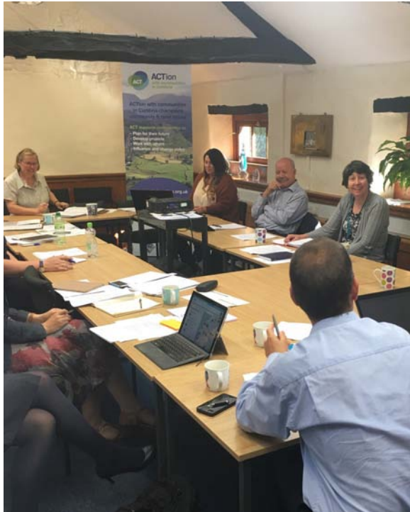
Cumbria Resilience Network meeting

ACT also chairs the Community Resilience Network (CRN) of agencies supporting communities with emergency planning. The CRN meets six times a year, reviews Community Emergency Plans and works to embed community involvement in county emergency planning, response and recovery plans.