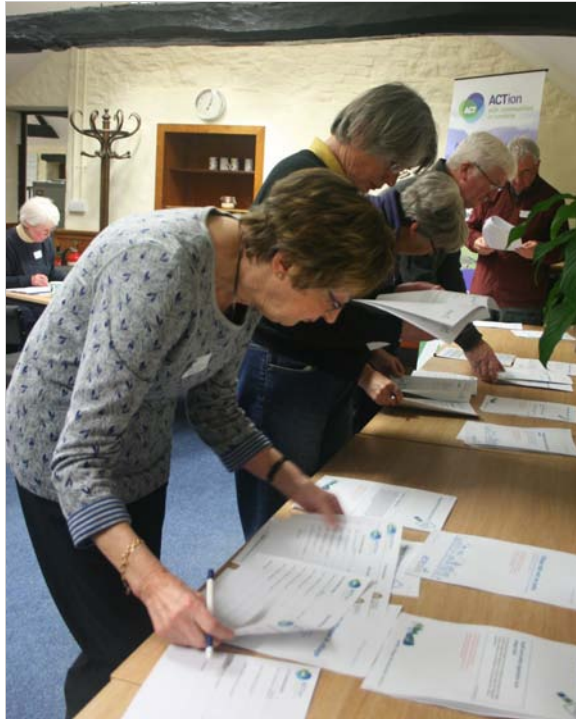
Village Halls Managing Risks Workshop