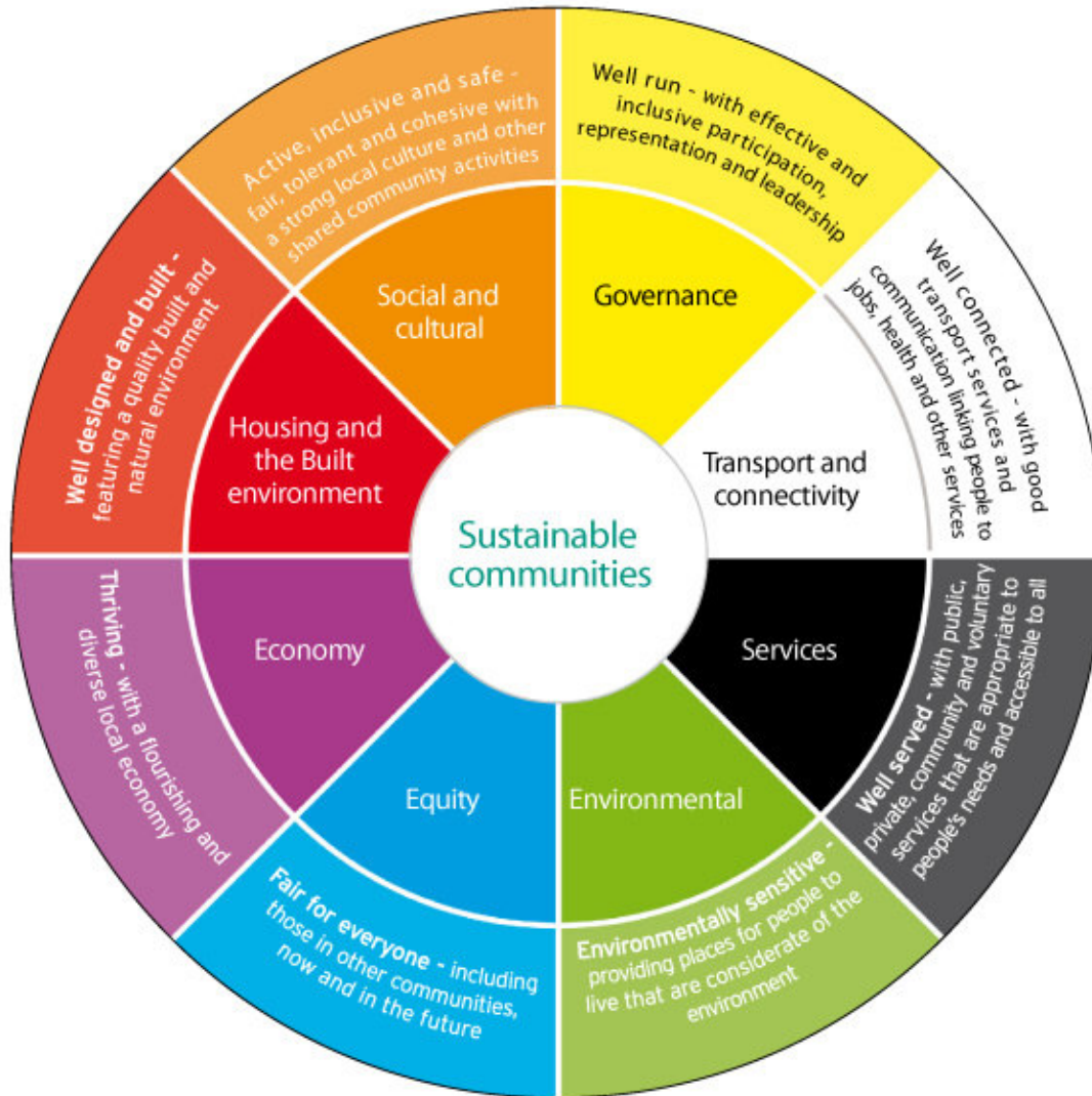
The Egan Wheel

Sustainable development was originally defined as “meeting the needs of the present without compromising the ability of future generations to meet their own needs.” In 2004 Sir John Egan was asked by the Deputy Prime Minister to examine how communities could be more sustainable.