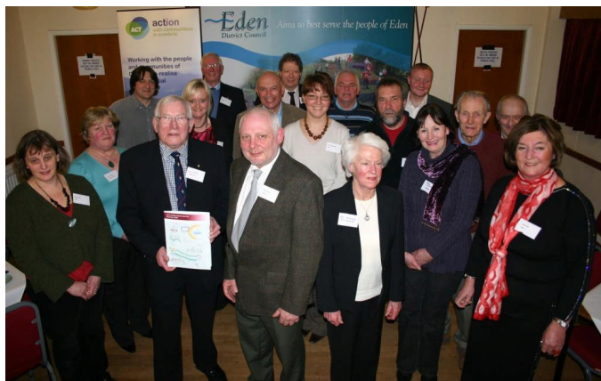
Heart of Eden Community Plan Group – Feb 2010