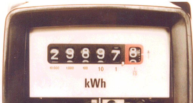
The digital meter pictured here reads: 29897

If you have a 'digital meter' simply read the first five digits.