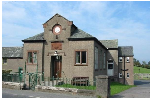
Bolton Memorial Hall

It was agreed that the Memorial Hall would own and have responsibility for maintaining and insuring the panels. The Hall Committee would keep 64% of the income, with the Development Trust receiving 36%.